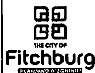
EXHIBIT C CITY APPLICATION

City of Fitchburg Planning/Zoning Department 5520 Lacy Road Fitchburg, Wi 53711 (608-270-4200)